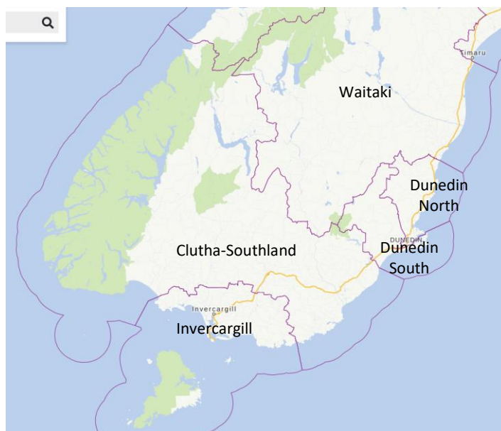
(a) Current boundaries