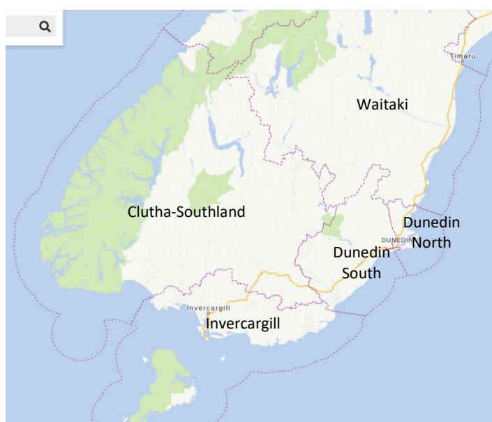
(b) Representation Commission Proposal (see also Figure 2)